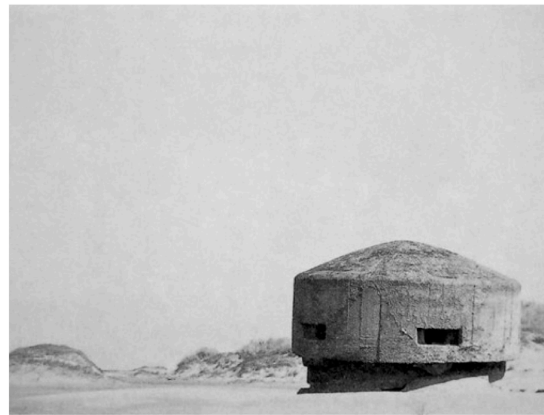
Paul Virilio, Bunker Archeology