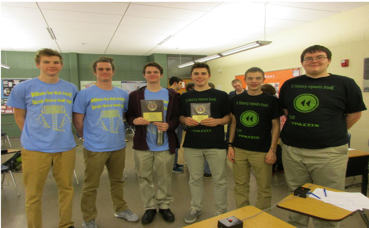
Congratulations to Williams Bay High School's (WI) Varsity and Junior Varsity teams that swept the state National History Bowl Championship and recently competed at the National Level in Washington, DC.