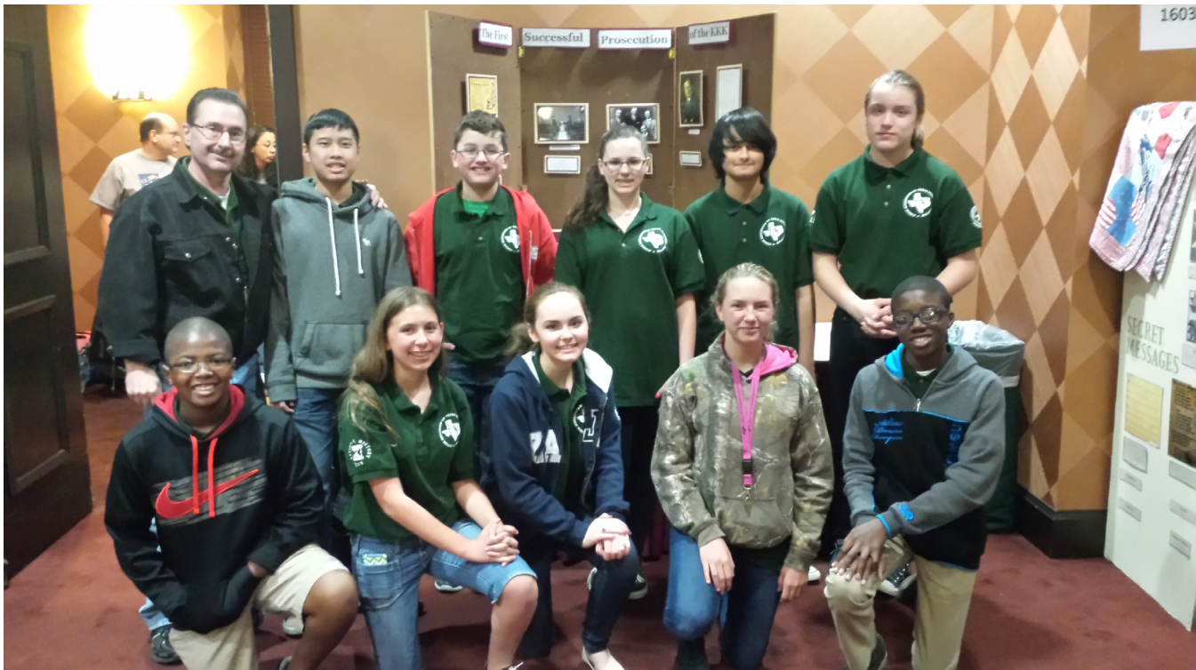
Hopewell Middle School (TX) attending the TSHA's Jr. Historians Annual Meeting and History Fair in Dallas, Texas on April 2nd to compete with their chapter project about the first successful prosecution of the Ku Klux Klan as well as several individual papers and projects.