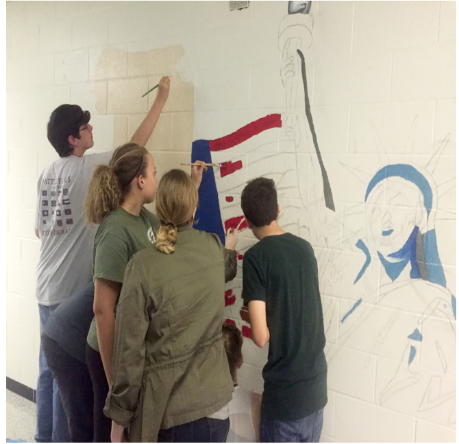
New Braunfels High School (TX) working on the mural in their "History Hallway" that will focus on the amendments to the U.S. Constitution.