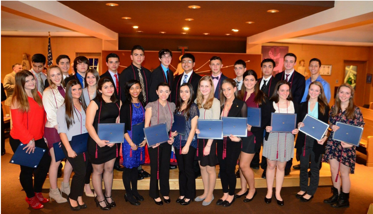
St. Francis Preparatory School (NY) inducting 30 members into the National History Scholars Society.

The NHSS was created in Spring 2009 to recognize the truly outstanding members in each Club. Nominees are expected to hold a 3.5 GPA in honors history classes, have been a member of their History Club for 2+ years, and be nominated by their Club Advisor. There were 702 student members inducted into the NHSS this spring (4.6% of total NHC student membership), and they proudly wore burgundy honor cords at graduation as a symbol of their academic excellence in the study of history. To view the entire list of inductees please visit our NHSS page on our website.