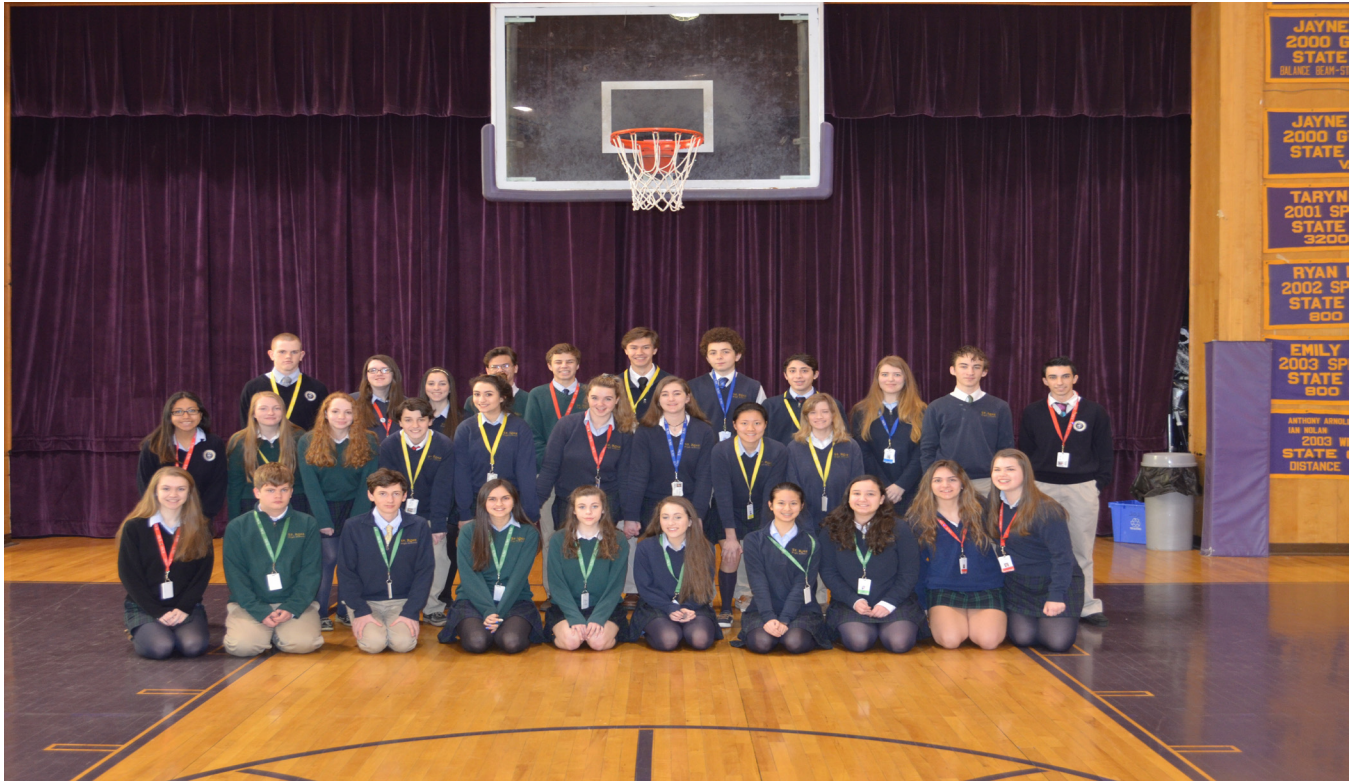
St. Rose High School (NJ) went on a trip to New York City with select members of the Club and international students from China for a cultural exchange of food, facts, and fun. They visited Chinatown, a Mahayana Buddhist Temple, the NYC Public Library, St. Patrick's Cathedral, and Rockefeller Center.