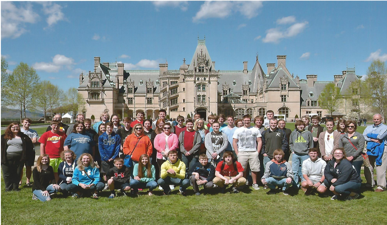
Richlands High School (VA) students and chaperones visiting the Biltmore Estate in North Carolina on Saturday, April 2!