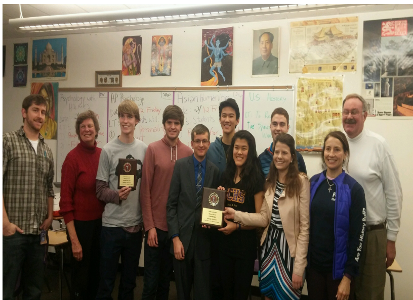
Fort Collins High School (CO) hosted the National History Bee and Bowl at their high school in February, with 20 teams and over 120 students present. They recently returned from DC where they participated in the National Competition.