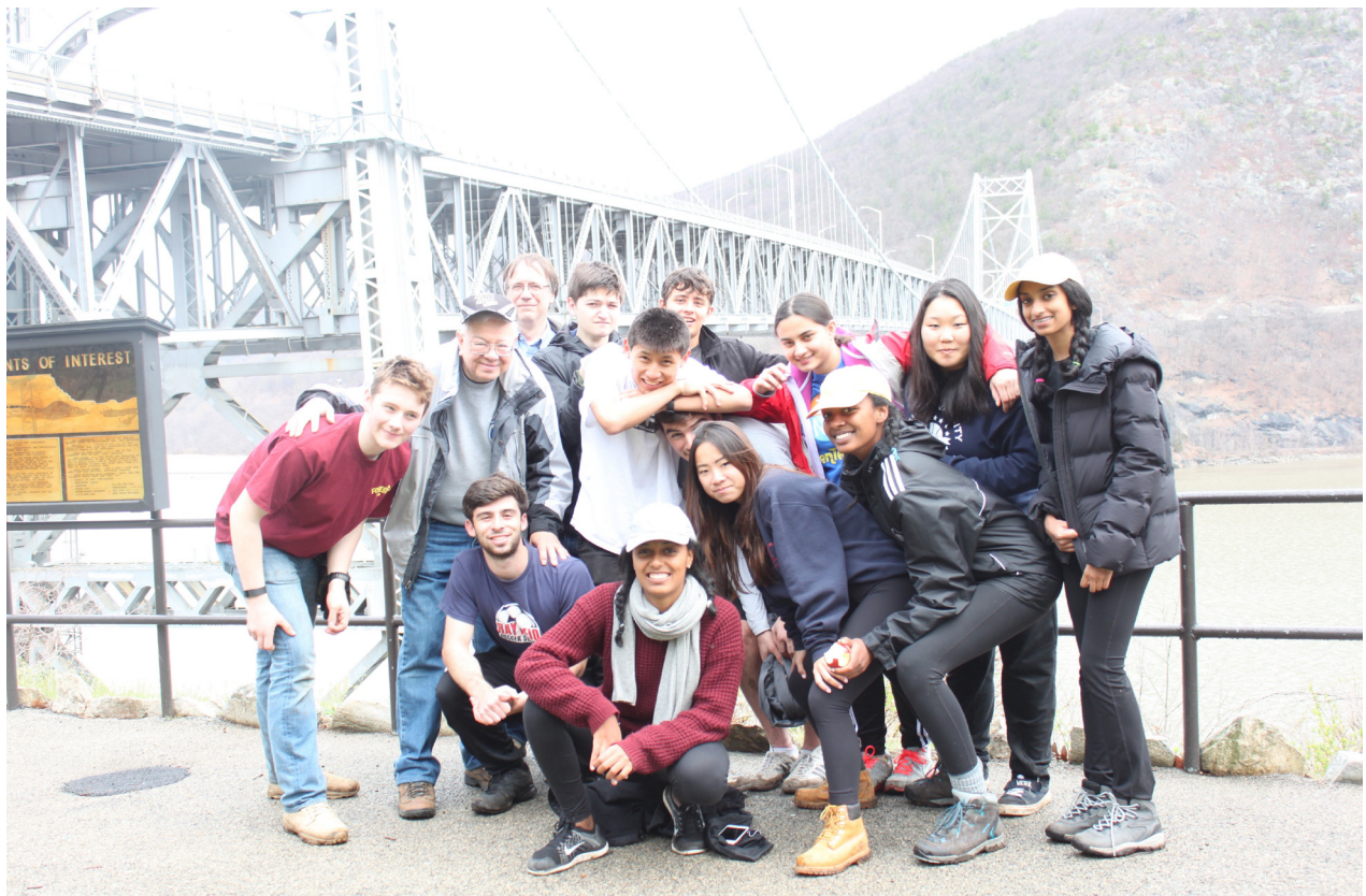
United Nations International School (NY) last project for the school year at Fort Montgomery where they removed the cannon covers for summer storage, did trail maintenance, cleaned out the Revolutionary War spring, replaced old trail signs with brand new ones, and worked on the drainage ditches for better water flow. They also presented the Fort with a check for over $400 to help with new signage and to rebuild the trail system.