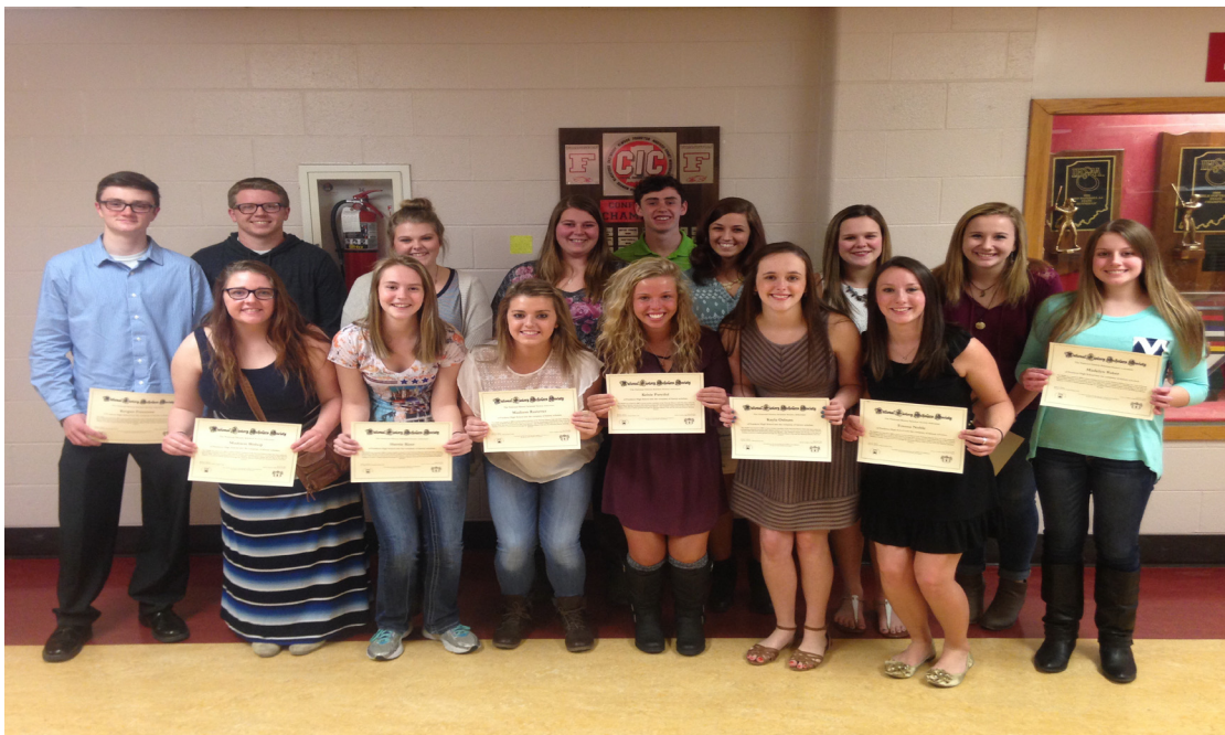
Frankton High School (IN) inducting a new round of students into the NHSS this spring.