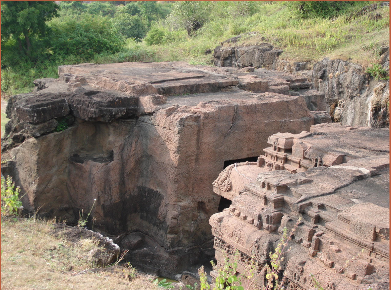
Chota Kailasa, Jain Cave 30, Ellora.

How often can we get away by explaining unfinished monuments as a result of dynastic collapse, a shortage of funds, or the death of a patron? In this illustrated talk, Vidya Dehejia provides a refreshing and unusual glimpse into unfinished monuments on the Indian subcontinent, suggesting two alternate ways of understanding several examples of unfinished work. One explanation lies in the somewhat casual attitude of patrons and devotees towards the concept of "finish," while a second answer lies in technique and "the rhythm of construction."