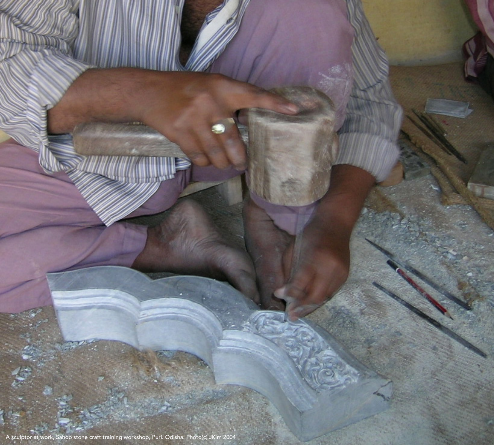
A sculptor at work, Sahoo stone craft training workshop, Puri, Odisha.